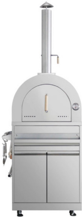
Product: Outdoor Pizza Oven and Cabinet Model Number: MK07SS304